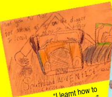
"I learnt how to go on a digger"