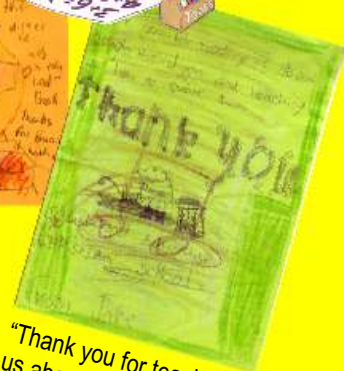
"Thank you for teaching us about Doug the Digger"

Great work, "digging in" with Doug the Digger!