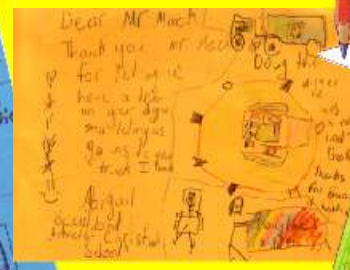
"Thanks for sharing with us"