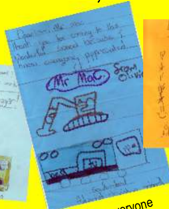
"I know everyone appreciated it"