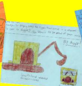
"I also learnt to be proud of my work"